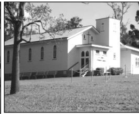
Our Saviour Marburg