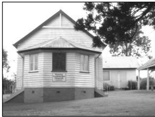
Trinity 593 Tallegalla Rd Lowood