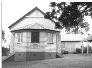
Trinity 593 Tallegalla Rd