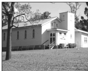
St John's 63 Prospect St