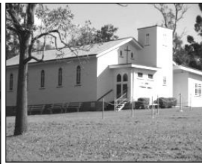
St John's 63 Prospect St