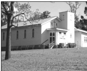
St John's 593 Tallegalla Rd Minden