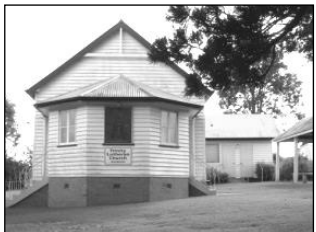
Trinity 17 Edmond St Marburg

Australian Evangelical Lutheran Church www.aelc.org.au