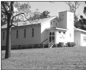
St John's 593 Tallegalla Rd Minden