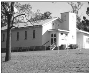
St John's 593 Tallegalla Rd Minden