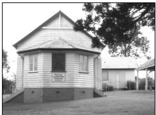
Trinity 17 Edmond St Marburg

Australian Evangelical Lutheran Church www.aelc.org.au