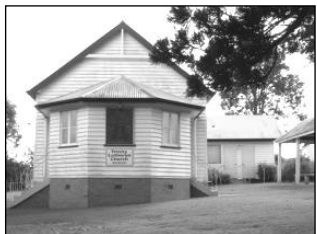
Trinity 17 Edmond St Marburg

Australian Evangelical Lutheran Church www.aelc.org.au