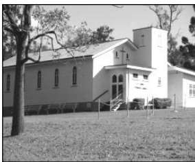
St John's 593 Tallegalla Rd Minden