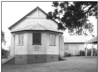
Trinity 17 Edmond St Marburg

Australian Evangelical Lutheran Church www.aelc.org.au