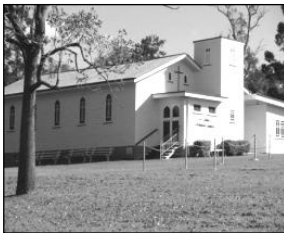
St John's 593 Tallegalla Rd Minden