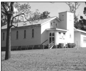
St John's 593 Tallegalla Rd Minden