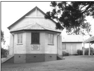
Trinity 17 Edmond St Marburg

Australian Evangelical Lutheran Church www.aelc.org.au