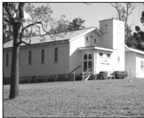
St John's 593 Tallegalla Rd Minden