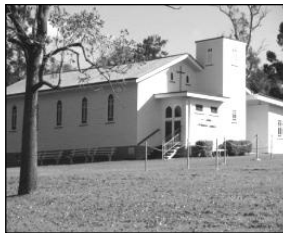
St John's 593 Tallegalla Rd Minden