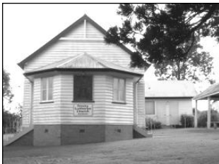
Trinity 17 Edmond St Marburg

Australian Evangelical Lutheran Church www.aelc.org.au