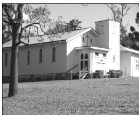
St John's 593 Tallegalla Rd Minden