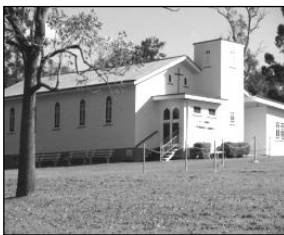
St John's 593 Tallegalla Rd Minden