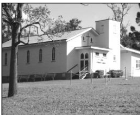
St John's 593 Tallegalla Rd Minden