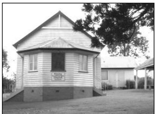
Trinity 17 Edmond St Marburg

Australian Evangelical Lutheran Church www.aelc.org.au