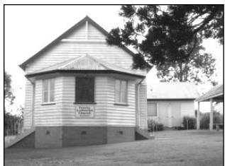
Trinity 17 Edmond St Marburg

Australian Evangelical Lutheran Church www.aelc.org.au