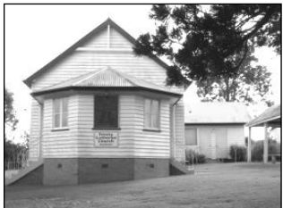
Trinity 17 Edmond St Marburg

Australian Evangelical Lutheran Church www.aelc.org.au