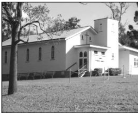
St John's 593 Tallegalla Rd Minden