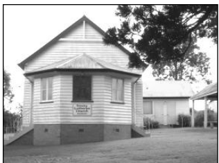
Trinity 17 Edmond St Marburg

Australian Evangelical Lutheran Church www.aelc.org.au