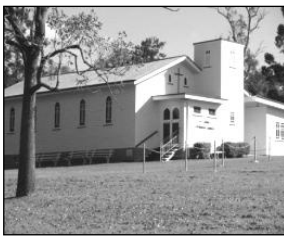
St John's 593 Tallegalla Rd Minden