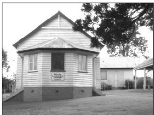
Trinity 17 Edmond St Marburg

Australian Evangelical Lutheran Church www.aelc.org.au