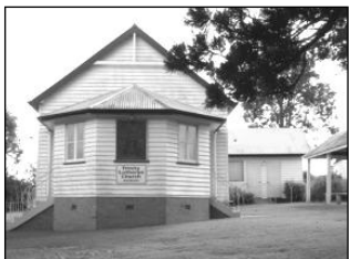
Trinity 17 Edmond St Marburg

Australian Evangelical Lutheran Church www.aelc.org.au