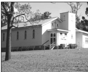
St John's 593 Tallegalla Rd Minden