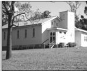
St John's 593 Tallegalla Rd Minden