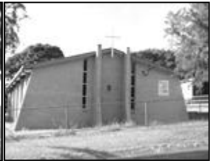
Our Saviour 63 Prospect St Lowood