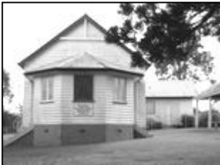
Trinity 17 Edmond St Marburg

Australian Evangelical Lutheran Church www.aelc.org.au