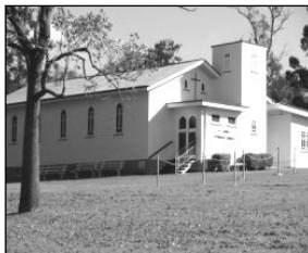
St John's 593 Tallegalla Rd Minden