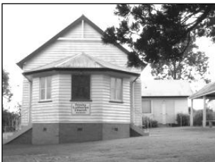
Trinity 17 Edmond St Marburg

Australian Evangelical Lutheran Church www.aelc.org.au