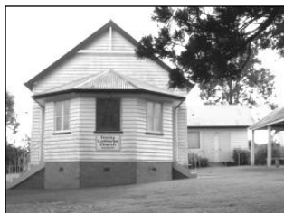
Trinity 17 Edmond St Marburg

Australian Evangelical Lutheran Church www.aelc.org.au