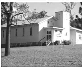
St John's 593 Tallegalla Rd Minden