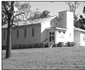
St John's 593 Tallegalla Rd Minden