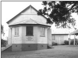
Trinity 17 Edmond St Marburg

Australian Evangelical Lutheran Church www.aelc.org.au