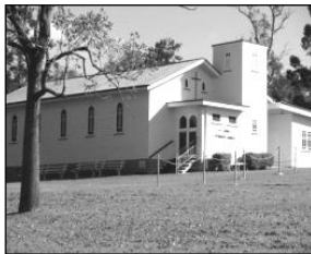
St John's 593 Tallegalla Rd Minden