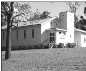
St John's 593 Tallegalla Rd Minden