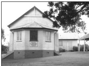
Trinity 17 Edmond St Marburg

Australian Evangelical Lutheran Church www.aelc.org.au